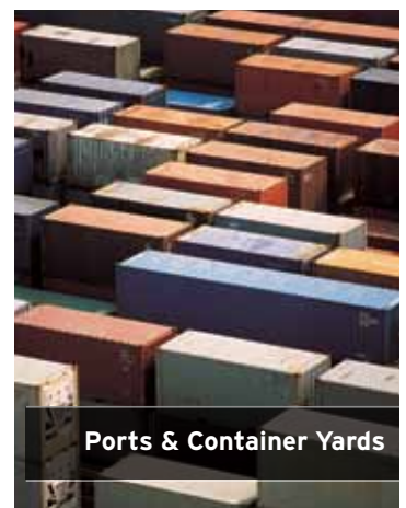
Ports & Container Yards